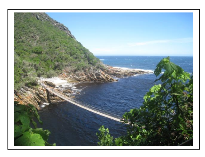
Storm Mouth Suspension Bridge, South Africa, sent by Ida Eisses, TC 31 Walsrode, Germany