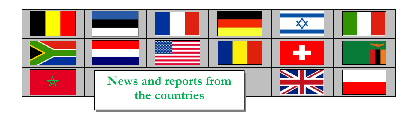
Agora Club Romania has sent the following report: