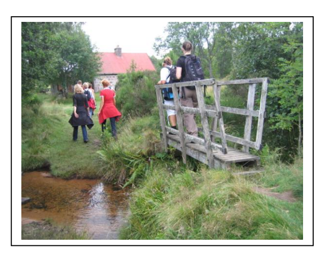
Bridge in the highlands of Aberdeen, photo taken by Karen at the LCI-Conference 2008